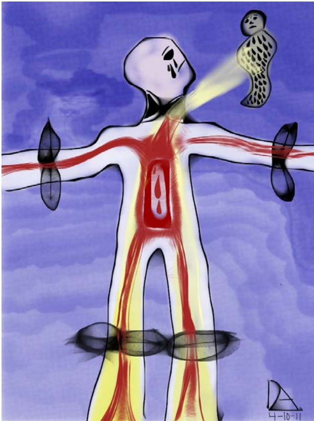
Tied Up At The Hospital – iPad/Metallic Print/ Archival Pigment/ Museum Glass/ Augmented Reality 24" x 33", Edition of 10