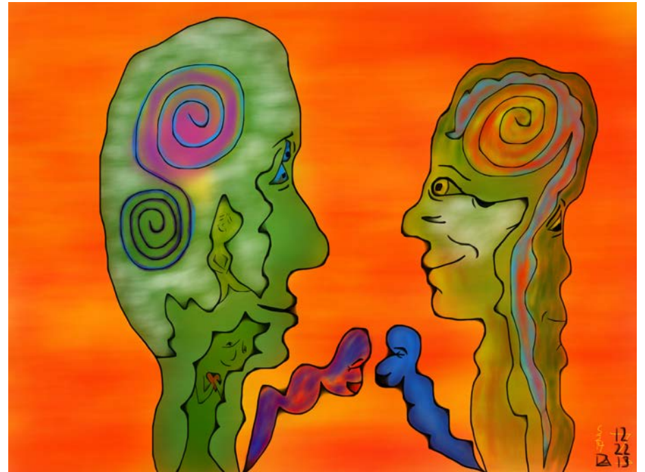
A Substance Called Understanding

– iPad/C-Print/Archival Laminate/Aluminum/Augmented Reality 39.75" x 29.75", Edition of 10