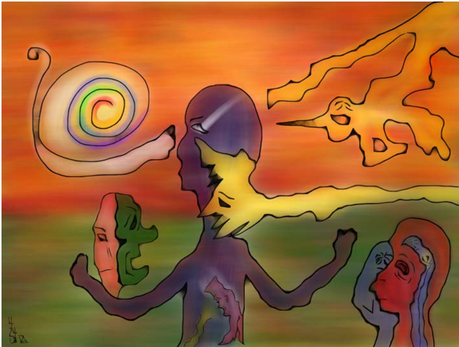
Permission to Enter

– iPad/C-Print/Archival Laminate/Aluminum/Augmented Reality 39.75" x 29.75", Edition of 10