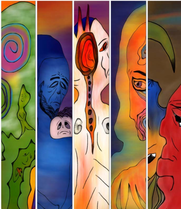
Permission to Enter Show Image Poster with Augmented Reality