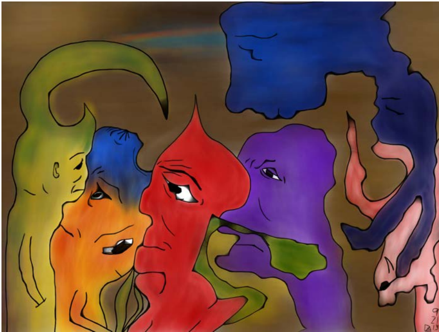
Just One Moment

– iPad/C-Print/Archival Laminate/Aluminum/Augmented Reality 8" x 6", Edition of 10