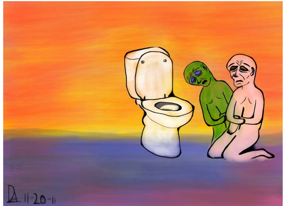
Nauseous By The Toilet – iPad/Metallic Print/Archival Pigment/Museum Glass/Augmented Reality 48" x 35", Edition of 10