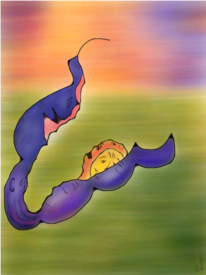
Their Place in the Sky

– iPad/C-Print/ Archival Laminate/ Aluminum/ Augmented Reality 14.5 x 19.75", Edition of 10